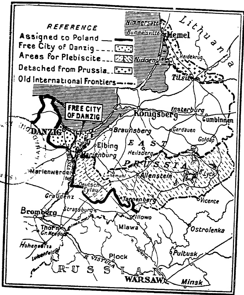
MAP ILLUSTRATING DANZIG AND PLEBISCITE AREAS IN EAST PRUSSIA